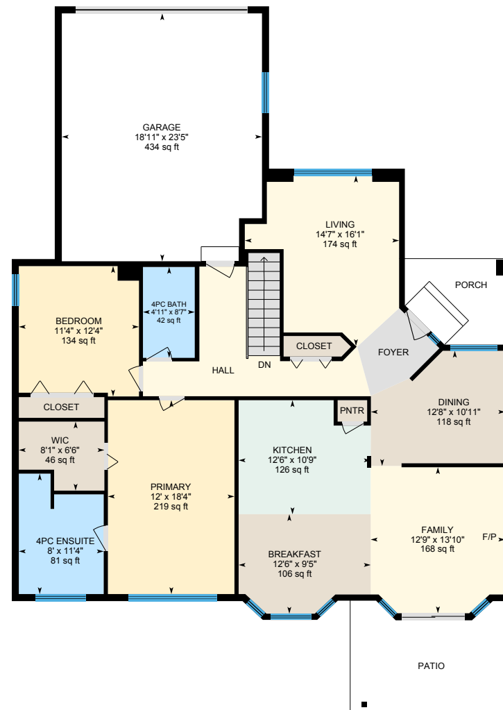
Main Floor Exterior Area 1603.06 sq ft