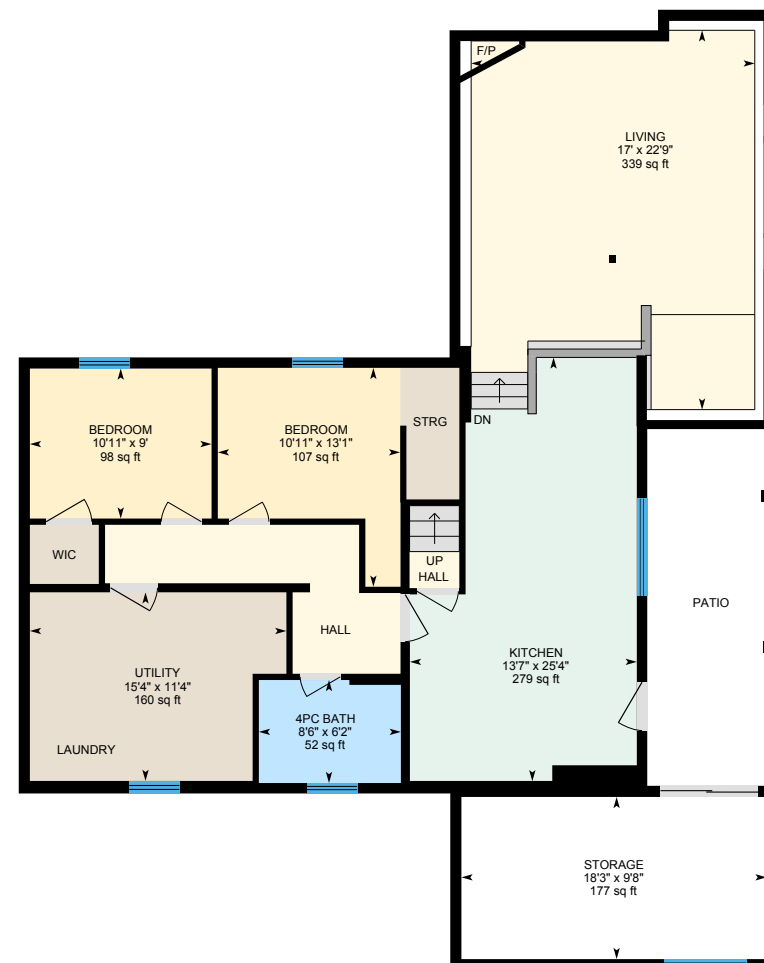
Basement Exterior Area 1374.14 sq ft