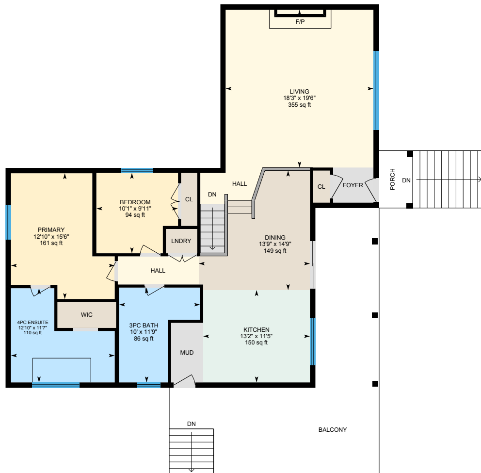
Main Floor Exterior Area 1473.14 sq ft

Main Building: Total Exterior Area Above Grade 2847.28 sq ft