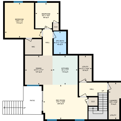
Basement Exterior Area 1287.14 sq ft