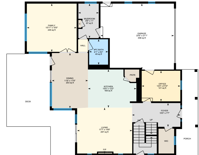
Main Floor Exterior Area 1551.20 sq ft