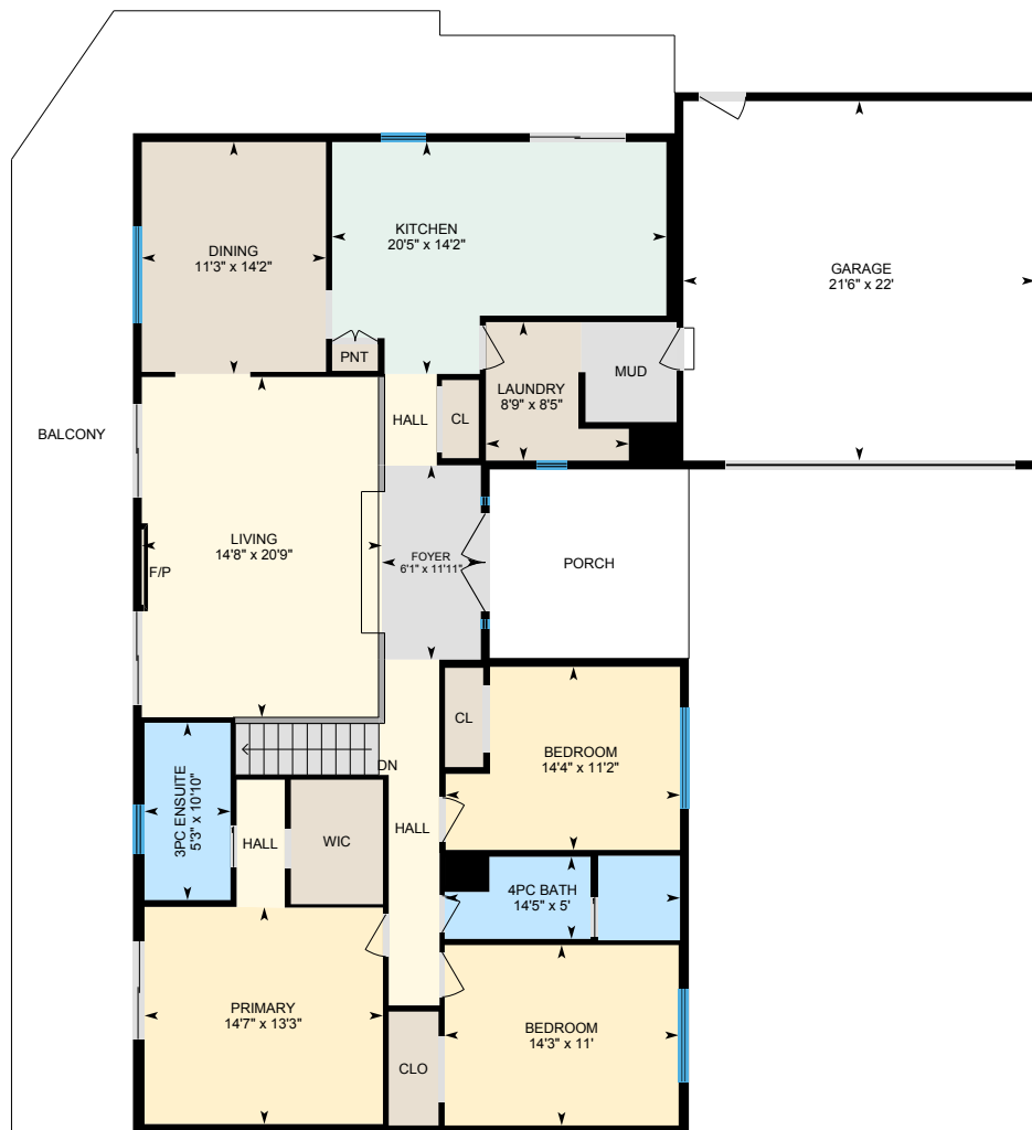
Main Floor Exterior Area 1920.52 sq ft

Main Building: Total Exterior Area 3739.37 sq ft